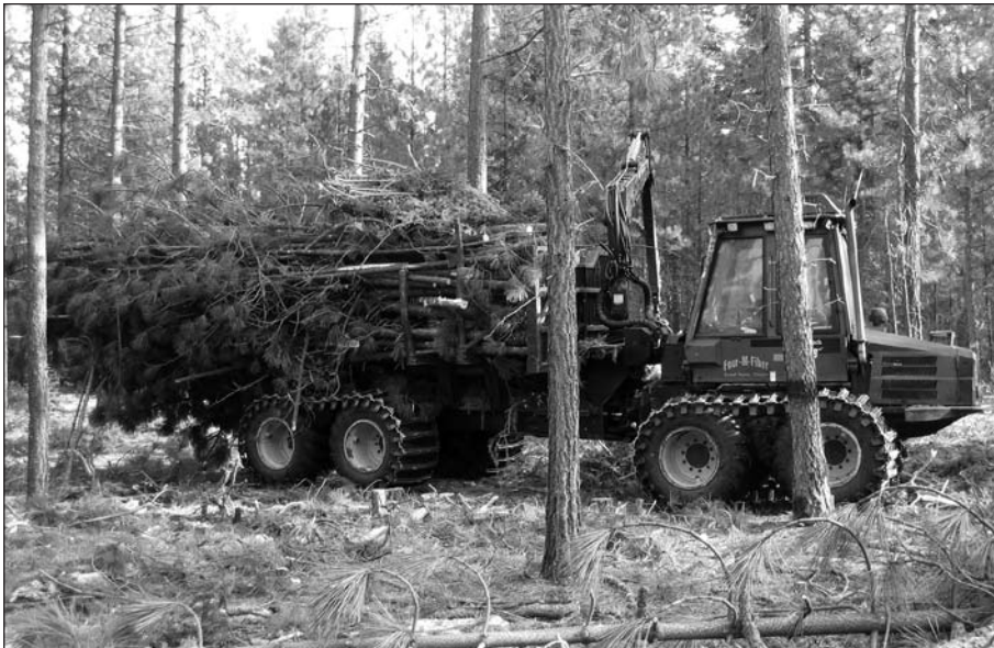
Strategically placed fuel-reduction treatments may produce merchantable and nonmerchantable timber. Finding ways to use nonmerchantable timber in some areas may help offset the costs of fuel treatments for other areas.

“Where such forest lands have been protected from fire, as they are very largely through the progress of settlement, young trees have usually sprung up in great numbers under or between the scattered veterans which had survived the fires...”