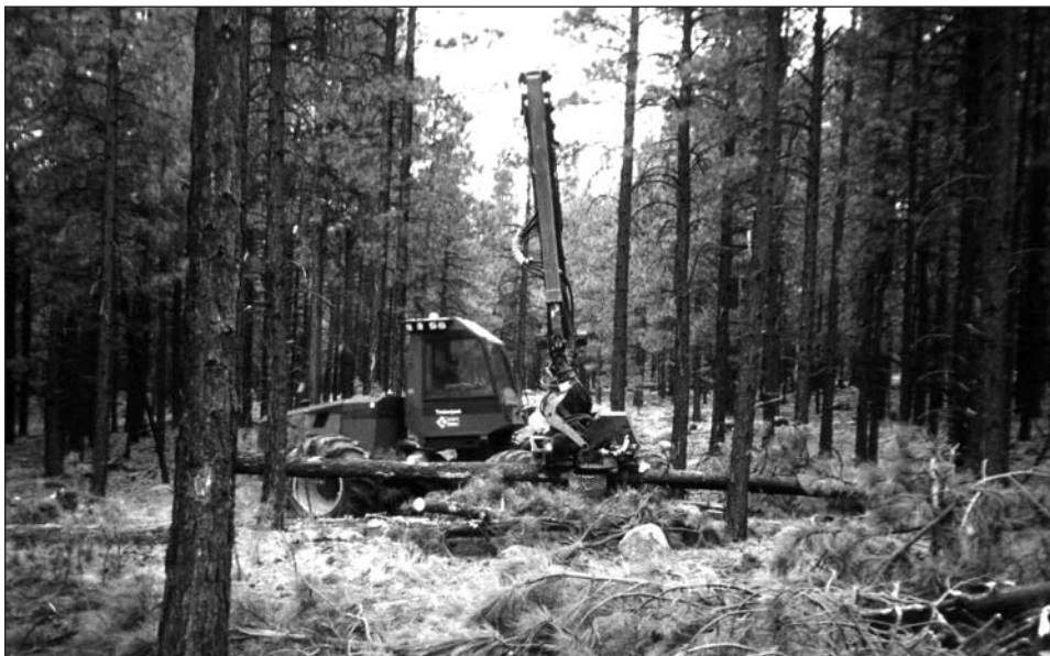
Unprecedented levels of fuel have accumulated in many dry western forests, thus increasing their fire hazard.