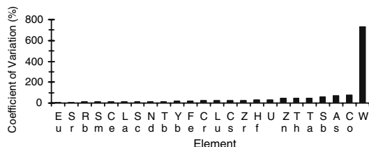
Fig. 2 Coefficients of variation (standard deviation standardized to the mean, Sokal and Rohlf 1981) of elements measured in surface dust of Fallon. For all elements, n = 125 . Bromine, molybdenum, and nickel are not included here because they had many values below the detection limits

Most of the elements measured in surface dust show little variability across sampling points within and around Fallon, with coefficients of variation (standard deviation standardized to the mean, Sokal and Rohlf 1981) of less than 50% (Fig. 2). This establishes a background pattern with little spatial variability in atmospheric deposition of metal particulates across the greater Fallon area. In sharp contrast to this pattern of little spatial variability, tungsten shows large