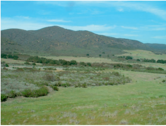
FIG. 1. Coyote brush-annual grassland boundary. Note the dense band of coyote brush and individuals expanding into the grassland (Photograph by Paul Laris).

in a positive light primarily because it is a native shrub expanding into largely exotic grasslands. In the first case the vegetation form—grassland—is deemed most critical, while in the latter case it is the vegetation origin—nativeness—that matters most (Laris et al. 2017).