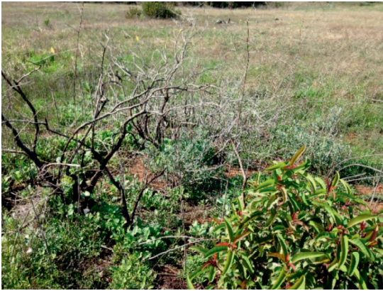
FIG. 8. A mix of CSS shrubs recovering three yr after the 2013 Spring fire on a site formerly dominated by coyote brush. Note the large burned stems of dead coyote brush shrubs, lack of dense exotic grass cover and presence of bare soil.

clear whether coyote brush will continue to advance onto the valley floor which is still dominated by grasses. We do not doubt the facilitating role played by coyote brush; rather, we suggest caution when interpreting the results suggesting that CSS shrubs will continue to be dominant in the understory as the coyote brush advances into lower elevations with more gradual slopes and deeper soils, areas where, it has been argued by some, that native grasses and forbs would have been the dominant cover (Wells 1962; Callaway and Davis 1993; Keeley 2005). It should be noted, however, that Zavaleta and Kettley (2006) documented that coyote brush facilitated the conversion of previously disturbed level valley floors from grassland to woodland at Stanford University's Jasper Ridge Biological Preserve in San Mateo County, northern California.