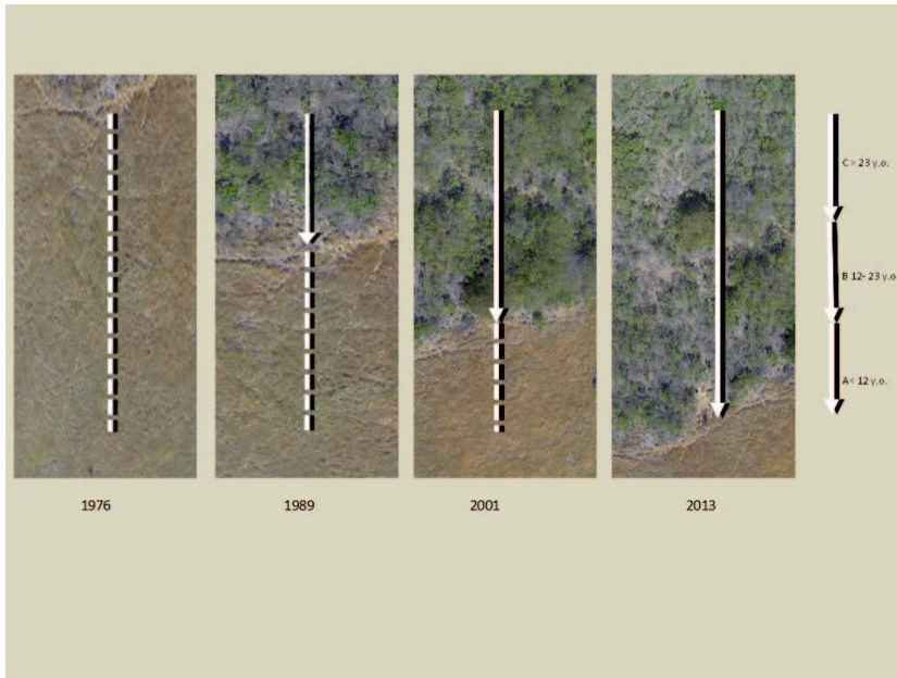
FIG. 5. Schematic of study design showing progression of coyote brush advancement.