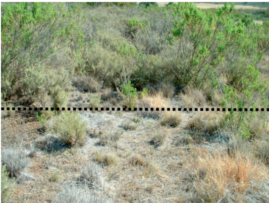
FIG. 7. Age class A (foreground) transitioning to age class B (background).

When examining B. pilularis abundance within each age classification for signs of facilitation of other CSS species, results show a non-monotonic increase in native species (Table 3). Of the 125 native plants encountered in class A, 30% were B. pilularis . The number of natives increased in class B to 322, as did the number of B. pilularis . Coyote brush, however, comprised only 26% of natives in this age class. In class C, the number of natives decreased to 262, but the 92 B. pilularis made up 35% of them.