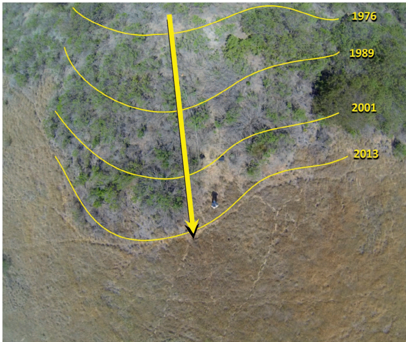
FIG. 4. View from above a Baccharis pilularis stand advancement over time based on image analysis for the four dates.