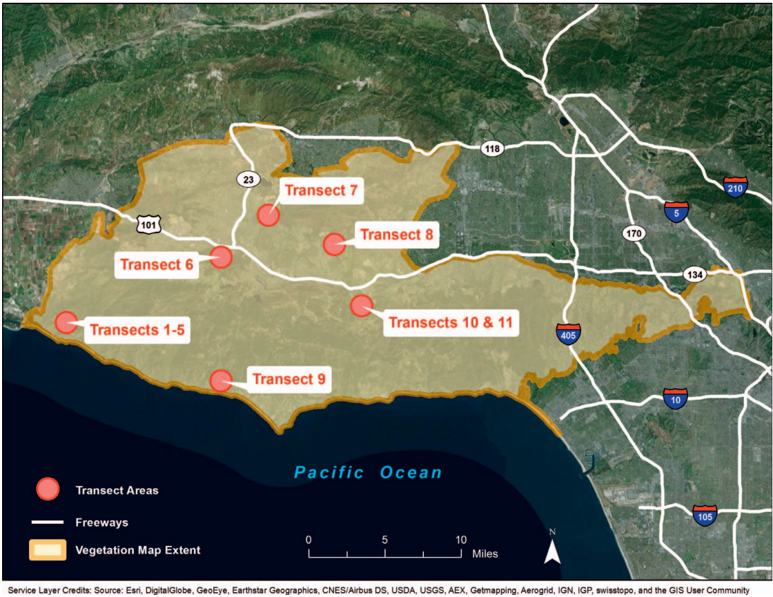
FIG. 3. Study areas in Santa Monica Mountains of southern California.

unstable soils, while California sage scrub is common on lower slopes and drier situations, with a distinctive variant on coastal bluffs. Oak-dominated woodlands are common in canyons and hill slopes with deeper, well-developed and well-drained soils. Grasslands today dominate valleys and lower slopes and terraces, generally with histories of grazing, cultivation and/or mechanical disturbances to reduce shrub cover (Laris et al. 2017). The fire regime for the Santa Monica Mountains varies by location, but there were major fire events in 1973, 1993, and 2013, giving the specific study areas a fire return interval of twenty yr or less. The extent and floristic character of pre-European California grasslands are poorly understood (Minnich 2008) but, whatever their original character, grasslands in the Santa Monica Mountains today are dominated by exotic annual grasses and forbs and exotic perennial bunch grasses.